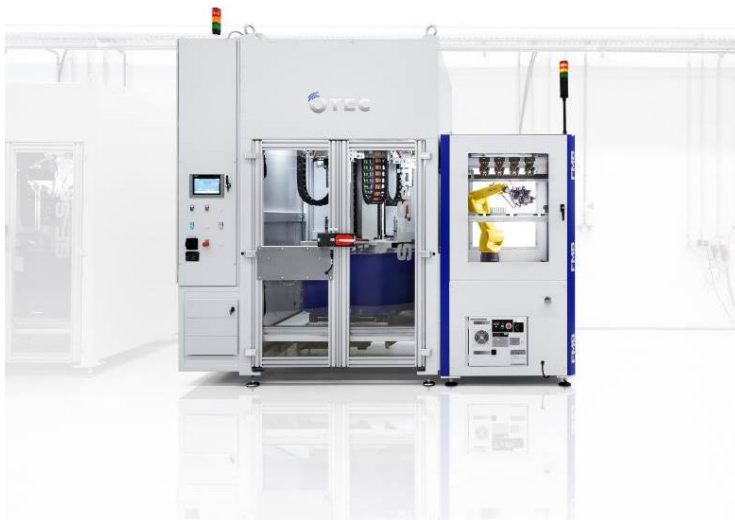
Stream finishing machine SF 3 RLS

The stream finishing process achieves uniform material removal. The controllable movement sequence allows the edges of the valve spool to be rounded in a targeted manner. Depending on the geometry and the initial state of the workpiece, the process equipment and process parameters will be individually adjusted. With the OTEC stream finishing machines, it is possible to carry out several processing steps in one go without additional effort. Short processing times, high reliability and easy automation makes stream finishing an extremely economical surface treatment method. The machine can be equipped with automatic loading by robot and three independent lifting units. This makes it possible that while two workpieces are being processed, a workpiece change can take place at the third station in parallel. This significantly reduces change-over times to a minimum while ensuring and high output and productivity. Depending on the desired result, geometry and initial condition of the workpiece, the processing times of valve spools take as little as three to six minutes.